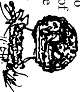
drawings by Maggie Rogers

Toxicology: Our toxicology committee provides identification and support services to the Poison Control Center in cases of mushroom poisoning throughout the state. The members maintain a pool of information on the identification of poisonous mushrooms, the latest information on the toxins, and information on antidotes (if any!).